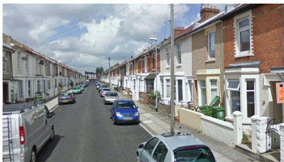
Example of a road included in the Portsmouth scheme

The Committee noted that officers from Portsmouth had advised that 20mph speed limits worked best in residential areas where roads could be described as being “beginning and end of journey” roads. The Committee heard that in Portsmouth it was considered that 20mph was an appropriate speed for the type and nature of these roads and that their experience showed that including main arterial roads in 20mph schemes initially at least is best avoided.